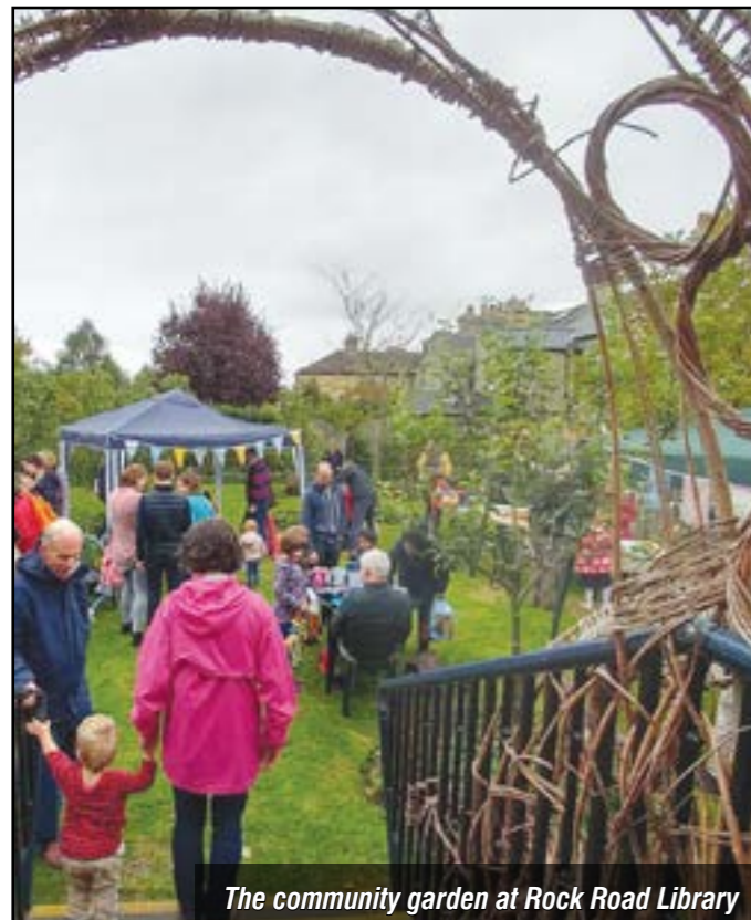
The community garden at Rock Road Library