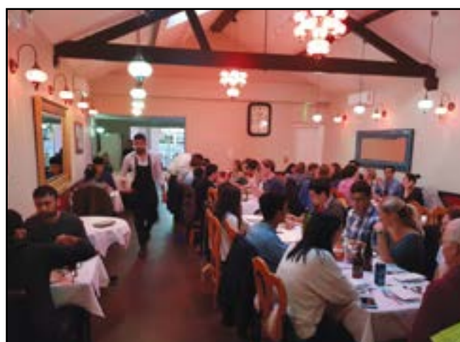
The Taj Tandoori, Cherry Hinton Road: the number 1 Indian restaurant in Cambridge on TripAdvisor is just around the corner!

Buying drinks in a restaurant can cost you as much as the meal itself, but another popular feature at the Taj is the venue's 'bring your own' policy. Whether you're looking to save a few pounds or you've got something reserved for a special occasion, the Taj lets you bring your own wine or beer – and there's no charge for small tables. Soft drinks, including a wonderful mango lassi, are available to purchase.