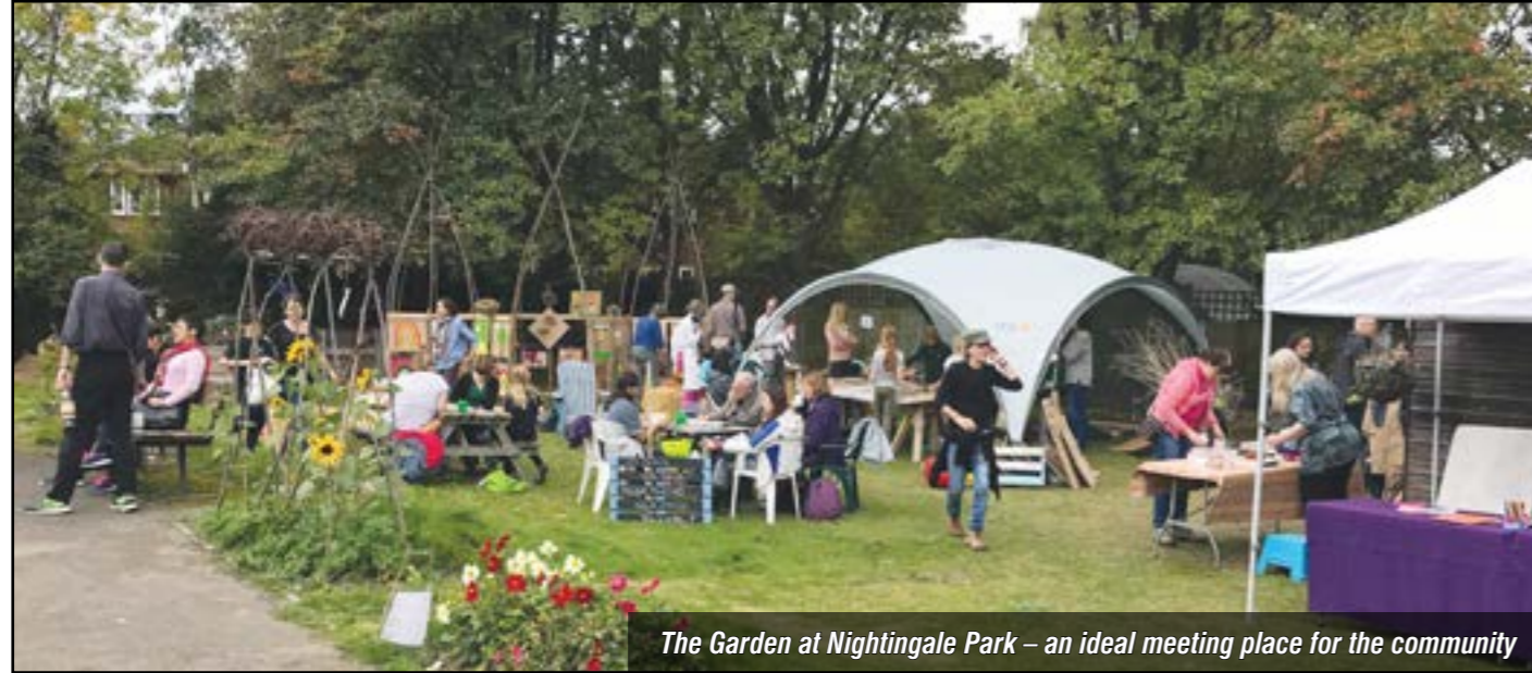
The Garden at Nightingale Park – an ideal meeting place for the community

N ightingale Park is set to see more improvements in 2018. Back in December 2015, the park was awarded three developer-levy funds: for the community garden (completed this February); to upgrade the playground; and to rebuild the pavilion and toilets.