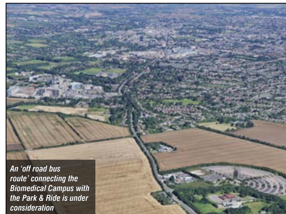
An 'off road bus route' connecting the Biomedical Campus with the Park & Ride is under consideration